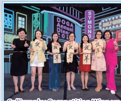
Calligraphy Competition Winners

The much-awaited DOGA Annual Dinner made a grand return on 17 th October 2023 at the Hotel Icon, attracting over 400 alumnae spanning classes from 1964 to 2016. Immersed in the vibrant "Neon Magic" theme, old girls enjoyed an evening of innovation and fun. The event featured dazzling venue decor, engaging games, integration of QR code to access the programme brochure, and a computerised lucky draw. Alumnae perfectly echoed the night's theme with their creative and eye-catching outfits. A memorable highlight was the calligraphy competition, where each class year showcased writing '拔萃' in Chinese brushstroke, stirring fond recollections of school days when brush pens were used for Chinese dictation. A hearty congratulations to the class of 1996 for clinching the Best Turnout Class award with an impressive 37 attendees. The dinner was abuzz with the joy of reconnecting with old friends, laughter, endless conversations, photo-taking, and lively souvenir shopping, making it an unforgettable night of camaraderie and celebration.