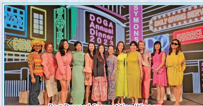
Best Dressed Competition Winners