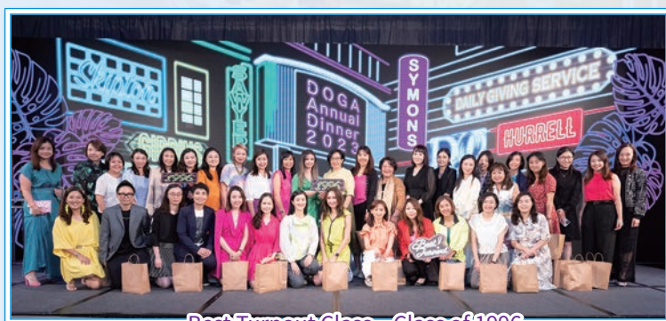
Best Turnout Class – Class of 1996